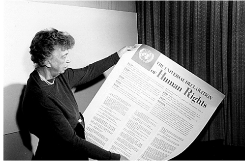
Eleanor Roosevelt chaired the UN Human Rights Commission and is recognized as the driving force behind the Universal Declaration of Human Rights.

Although the Declaration with its broad range of political, civil, social, cultural and economic rights is not a binding document, it inspired more than 60 human rights instruments which together constitute an international standard of human rights. Today the general consent of all UN Member States on the basic Human Rights laid down in the Declaration makes it even stronger and emphasizes the relevance of Human Rights in our daily lives.